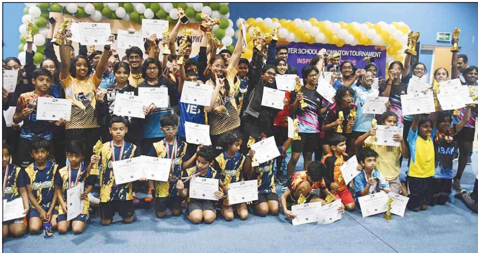
Participants of the IBAK Inter-school Badminton Tournament display their certificates and trophies at the end of the closing ceremony.