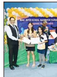
Top and above: excelled players congratulated by an official.