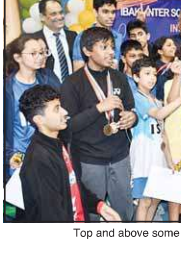
Top and above some of the winners celebrate.

IBAK can be reached on www.ibakkt.org or ibakcommittee@gmail.com